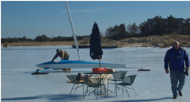
SKEETER STRATEGY TABLE

Looking for a Classic Long Island Iceboating Book pick up a copy of Warren Darress's book. You can email Warren Darress Jr. and purchase a copy before they are all sold. It's a classic.