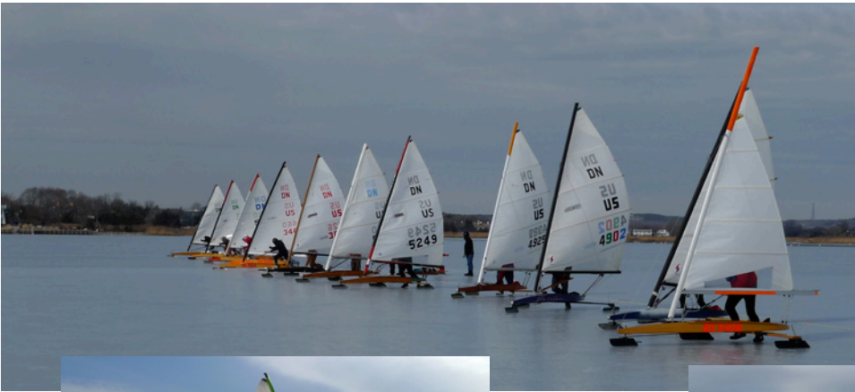
DN Gold & Silver Fleet 16 Boats - A Great Turnout this Year