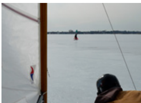
Rich starts the fleets