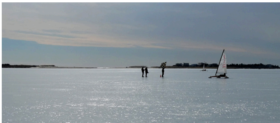
Race Committee Raise the Checkered Flag